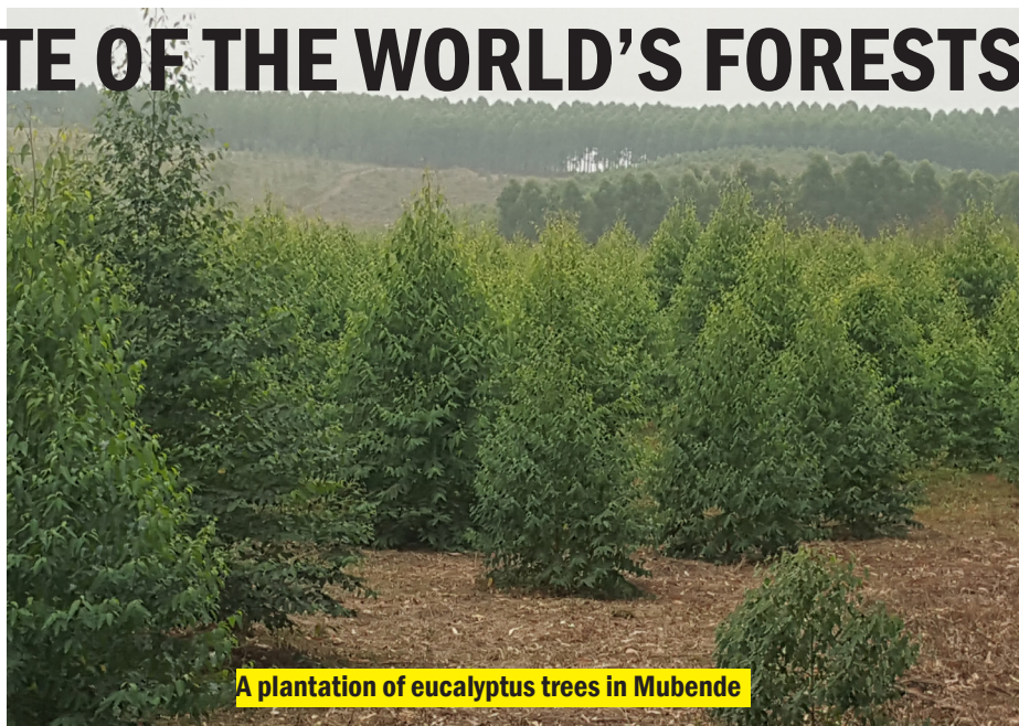
A plantation of eucalyptus trees in Mubende

Evidence is key to opening the forest pathways to sustainable development. While the importance of forests and trees to a healthy, prosperous planet is universally recognized, the depth of those roots may be greater than imagined. Several indicators under SDG15 focus on forests, specifically monitoring forest land and the share of forests under sustainable management. The Global Forest Resources Assessment (FRA), coordinated by FAO, found that the world's forest area decreased from 31.6 percent of the global land area to 30.6 percent between 1990 and 2015, but that the pace of loss has slowed in recent years.