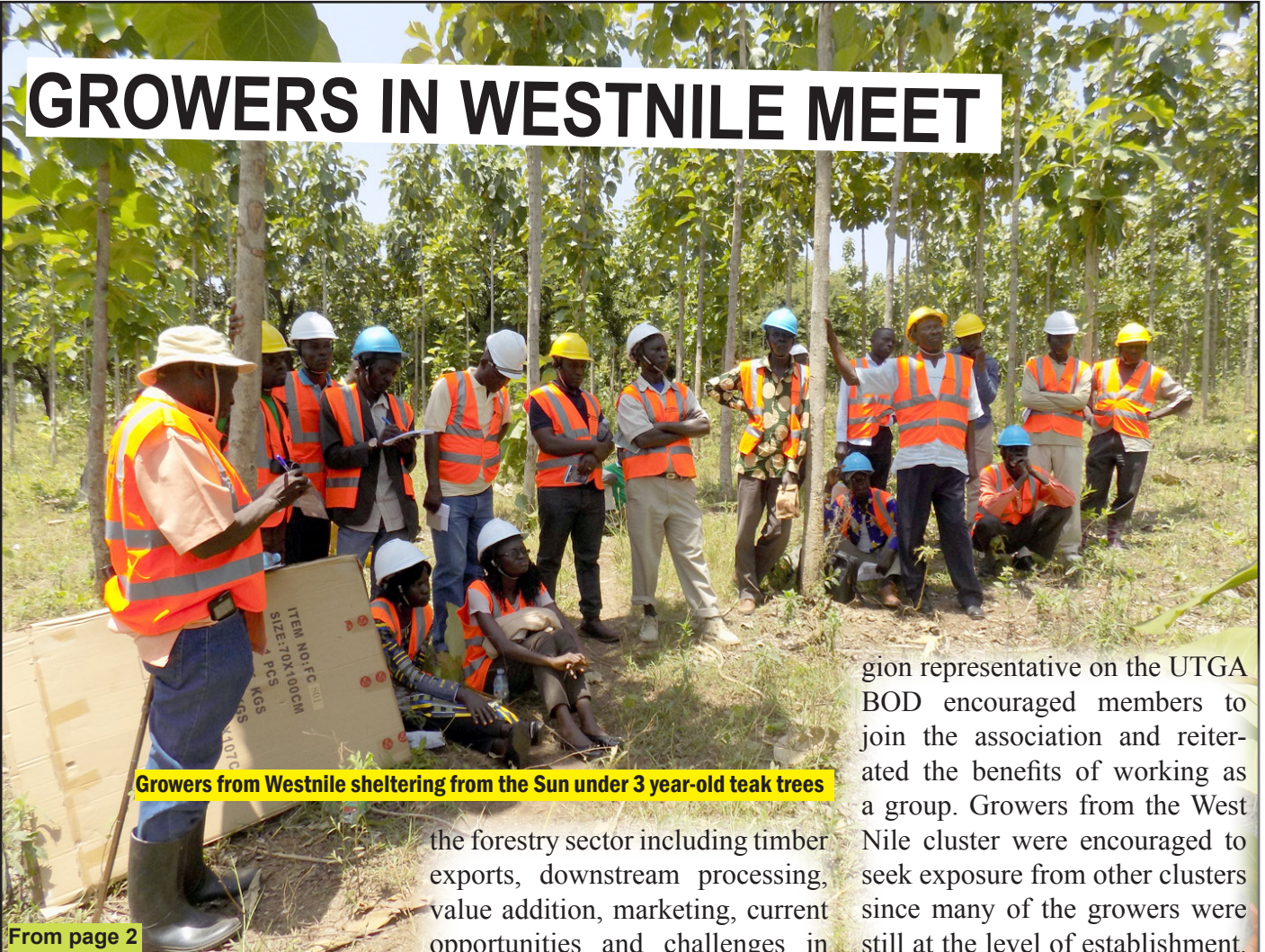
Growers from West Nile sheltering from the Sun under 3 year-old teak trees